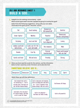
BUILD A GOD...