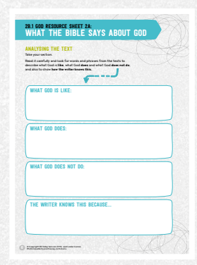
WHAT THE BIBLE SAYS ABOUT GOD