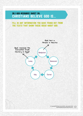
CHRISTIANS BELIEVE GOD IS...