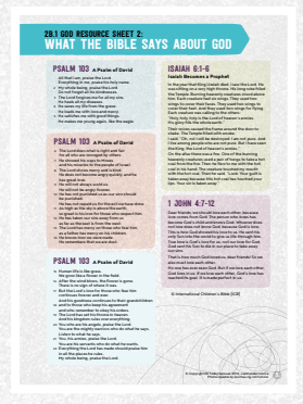
WHAT THE BIBLE SAYS ABOUT GOD