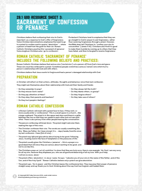
SACRAMENT OF CONFESSION OR PENANCE